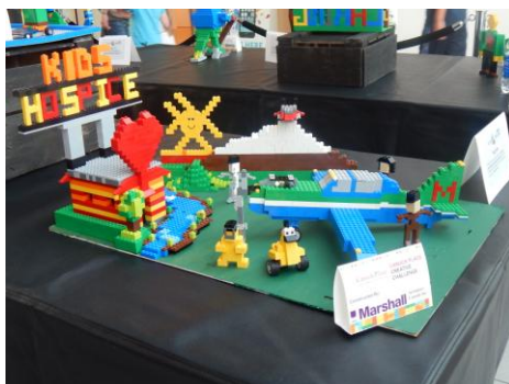
People's Choice Winner 2013 – Marshall Aerospace

The Sevenoaks customers will be encouraged to vote for their favorite Lego creation. At the end of the event we will tally all of the votes and announce the winning business, who will receive a free ¼ page ad in the Abbotsford News.