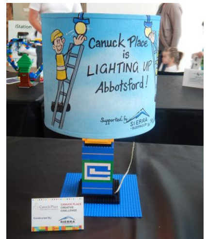
IDEA: Sierra Electric